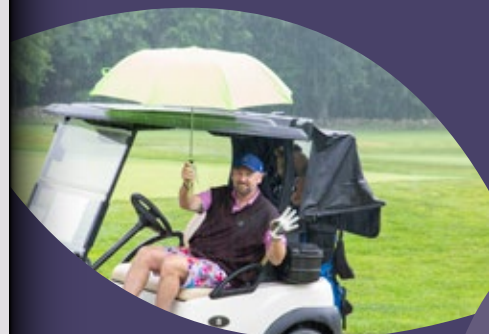
Lipton Golf Invitational pg. 5