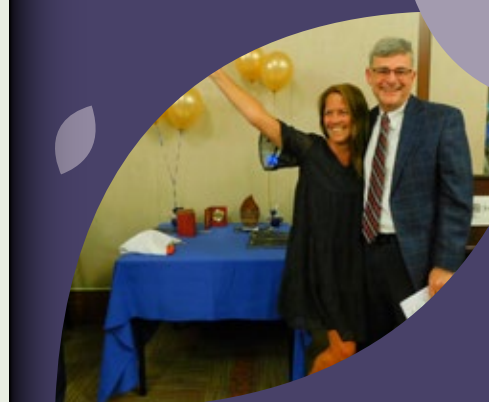
Employee Awards pg. 7

For more information on JSS Services call 1-833-JSS-LINK (577-5465)