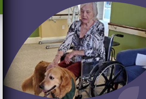
Slice of Life pg. 3