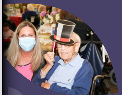
Family Day Reimagined pg. 3