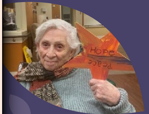
Slice of Life pg. 3