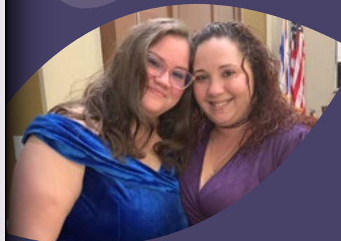
Holiday Party pg. 7