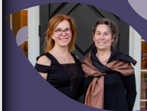
Fall Gala pg. 4