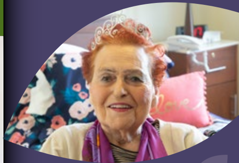
Centenarian Celebration pg. 3