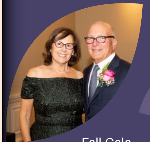
Fall Gala pg. 4